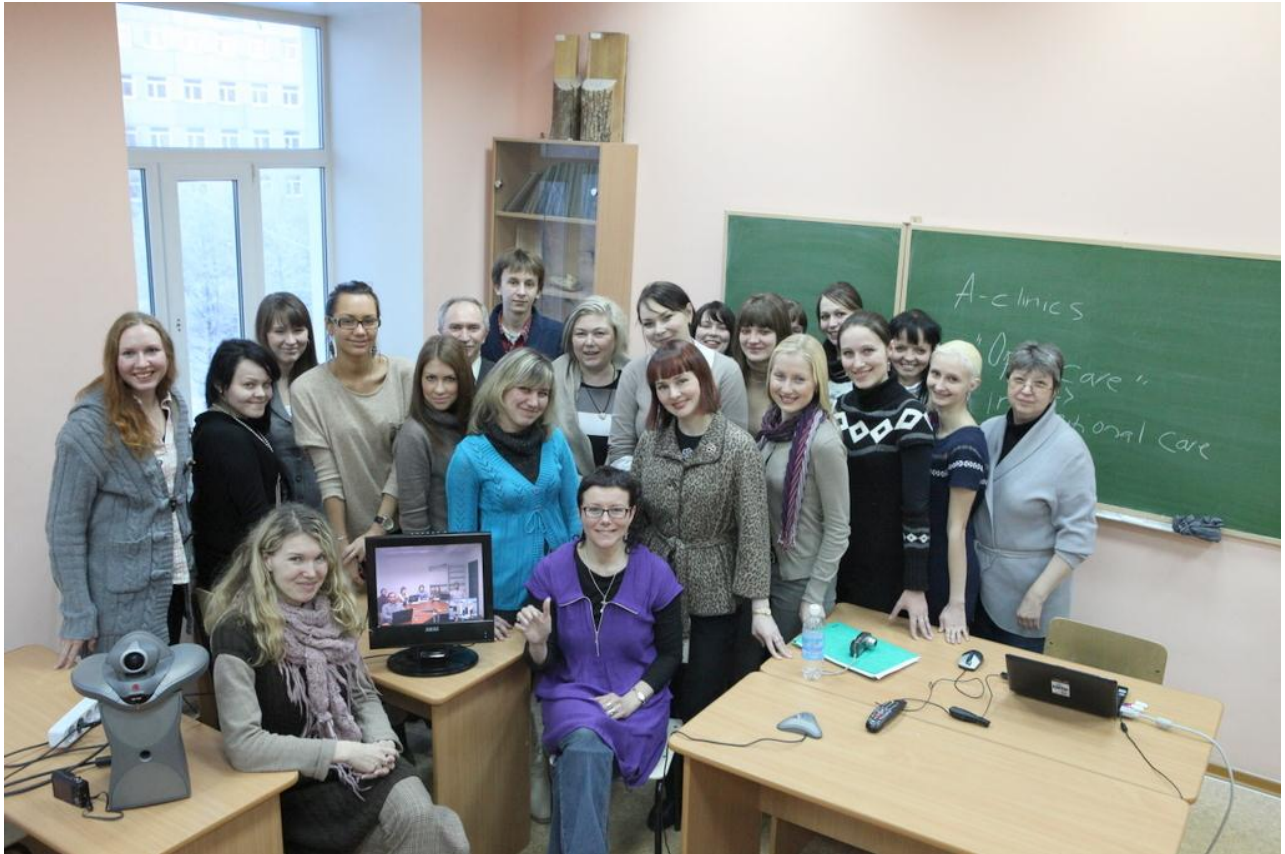
Winter school students 2012 at the course Social Policy and Human Rights. The course got good feedback.

Department of Social Work at the Institute of Pedagogy, Psychology and Social Work, NArFU, Arkhangelsk, Russia organized a winter school for the students of BCBU Master program in Comparative Social Work. This Russian – Finnish master collaboration was organized for the first time in January 2009.