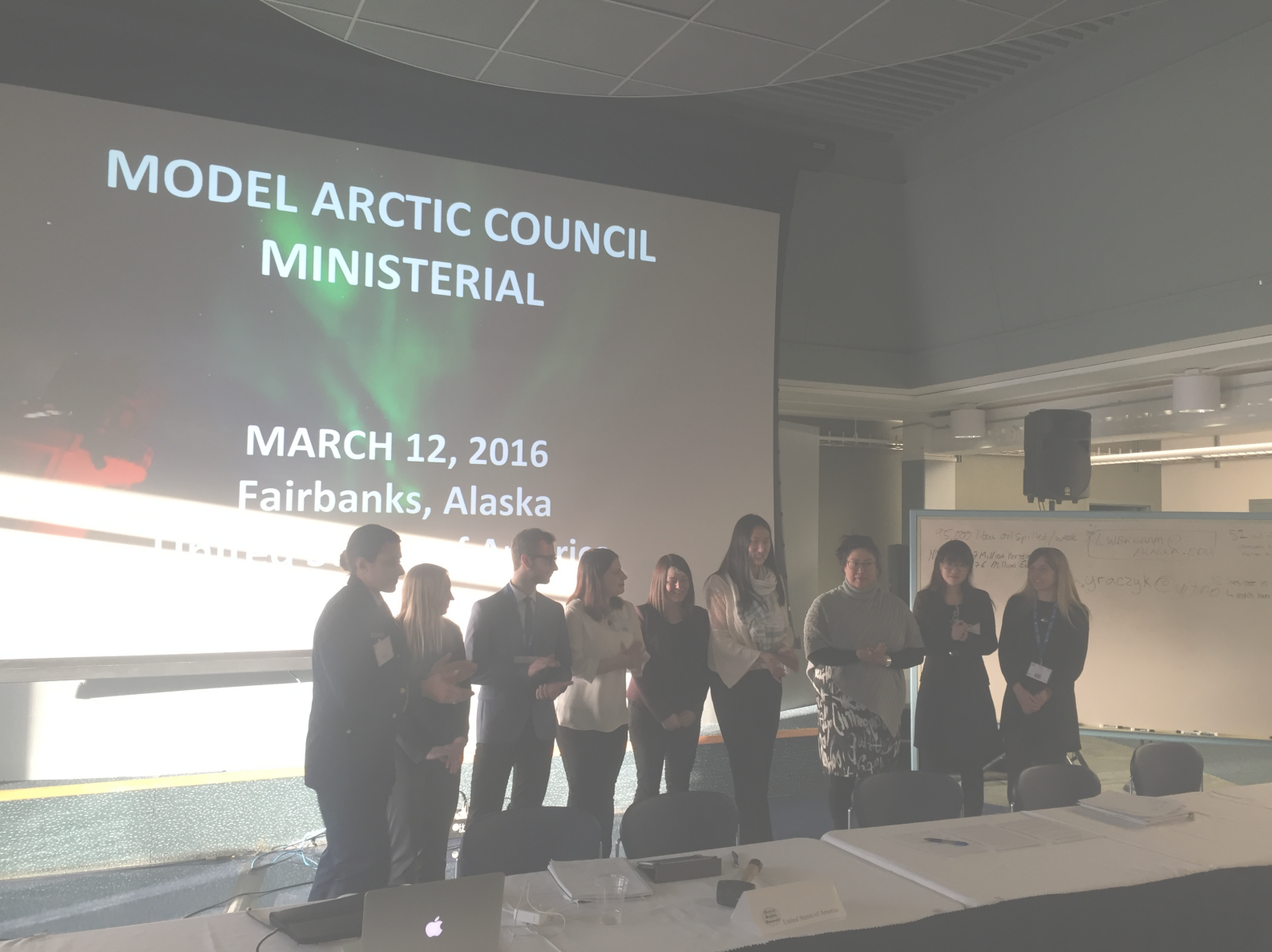
Model Arctic Council Ministerial Meeting in Fairbanks, Alaska, United States 12 March 2016