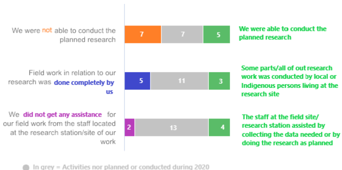
Figure 2 - Research Activities

Five respondents affirmed that the field work in relation to their research was conducted entirely by them, while 3 stated that certain parts/all of the research work was conducted by local or Indigenous persons living at the research site. The remaining respondents (n=11) did not plan nor conduct this activity. Eventually, 2 respondents did not get any assistance for their field work from the staff located at the site/research station. On the contrary, 4 were assisted by the staff of the station. Thirteen respondents did not plan nor conduct this activity during 2020 (see Figure 2).