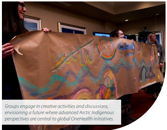
Groups engage in creative activities and discussions, envisioning a future where advanced Arctic Indigenous perspectives are central to global OneHealth initiatives.