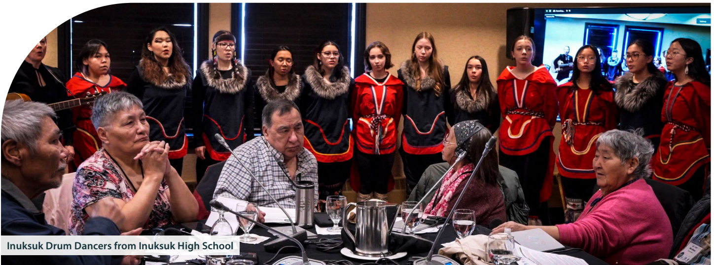
Inuksuk Drum Dancers from Inuksuk High School