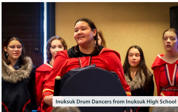
Inuksuk Drum Dancers from Inuksuk High School